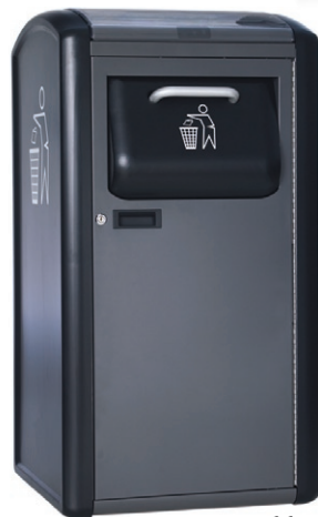
MADE IN USA CE AND ROHS COMPLIANT